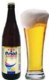
ORION BEER Item# 2701, 12/21.4oz Item# 2702, 4/6/11.3oz IDAHO ONLY

WORLD BEER CHAMPIONSHIPS AWARD: Silver Medal