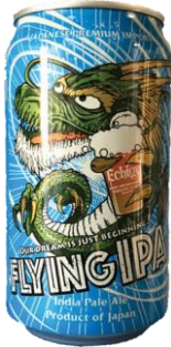
ECHIGO FLYING IPA Item# 1587, 24/350ML

Echigo Beer Company, known as Japan's first microbrewery for being the first brewery licensed after Japan changed its beer licensing laws in 1993, has updated its usual line-up with their Flying IPA. Usually focusing on ales such as red, white, and pale, the Flying IPA is a welcome change and offers more hoppy deliciousness with a semi-sweet barley backbone.