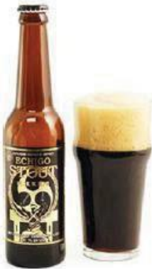
ECHIGO STOUT BEER Item# 1239, 12/330ML

Echigo Beer Company aimed to match the authentic Irish Stout by containing 100% malt. This beer is brewed with 1.3 times more malt in comparison to regular beers. They are also blended with seven different types of malt to complete the process. The manufacturing process takes 45 to 90 days to make this beer, while ordinary beer only takes 28 days. The malt blend adds depth to the flavor and the time taken to manufacture the product causes the drink to be fairly mild.