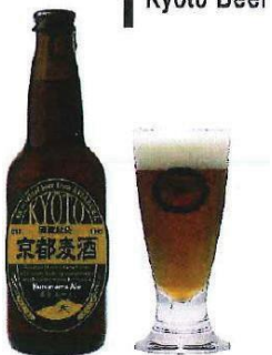
KYOTO KUROMAME ALE Item# 1533, 12/330ML

This beer was brewed using Japanese Sansho herb, and a special product found in the Iwate prefecture. Even with the Sansho herb included, the beer still has the citrus fruit taste.