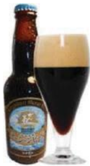
KUKUJURI OCEAN STOUT Item# 1269, 12/330ML

Brewed with whole fresh oysters and oyster shells, traditionally an English style with deep stout flavor with chocolate and coffee notes. 2006 Japan Beer Cup Gold Award 2008 World Beer Cup Silver Award